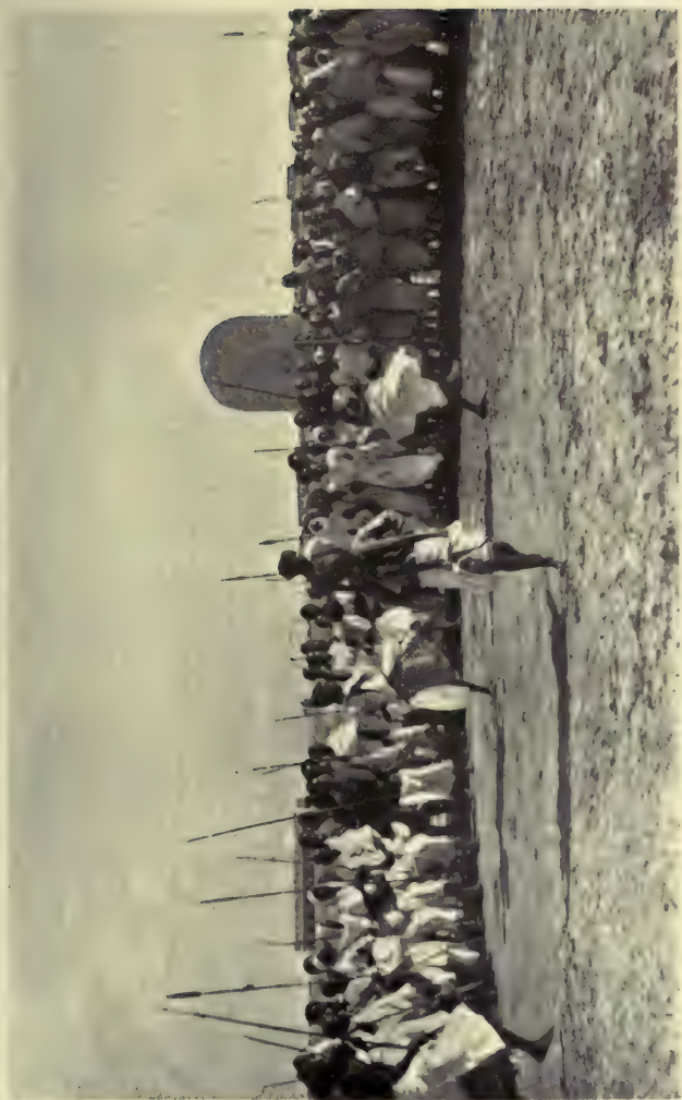
A SOMAL DANCE.